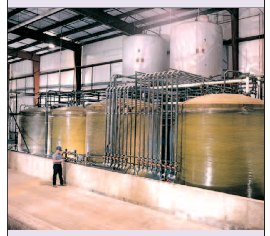
Outsourcing warehousing and distribution to third-party logistics provider WSI gave one leading plastics producer better flexibility in storage volume and handling capacity.

"The chemical industry is cyclical," he adds. "Our services allow chemical shippers to tailor their costs to the ups and downs of their business cycle."