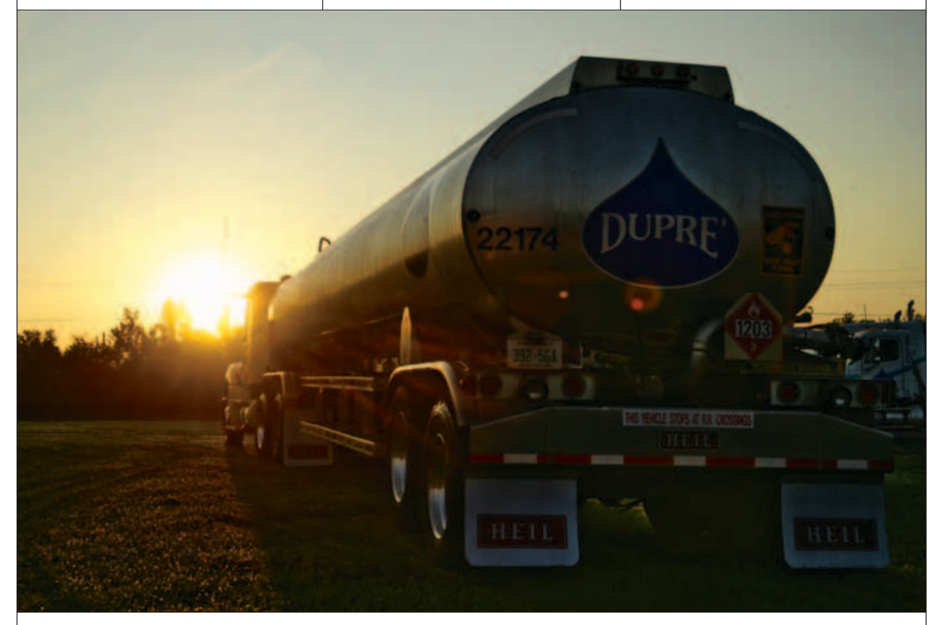
To meet chemical shippers' unique needs, Dupré Logistics operates a variety of specialized trailing equipment, including crude, chemical, and gasoline tankers; dry and temperature-controlled vans; reefers; and flatbeds.

Burgeoning demand is putting greater pressure on this limited supply of equipment and drivers.