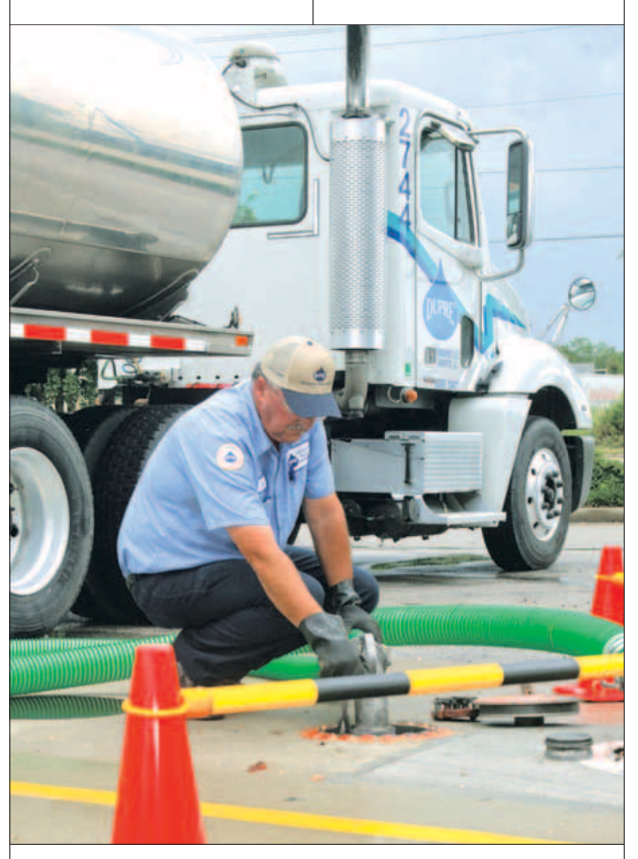
In addition to operating trucks, drivers transporting chemical shipments carry a responsibility for safely handling products, correctly managing equipment, and carefully following procedures.

Access to scarce capacity is just one benefit chemical shippers gain from 3PLs and carriers that understand chemical logistics inside and out. Because they work with so many customers – and, in the case of non-asset-based 3PLs, so many carriers – those partners' knowledge