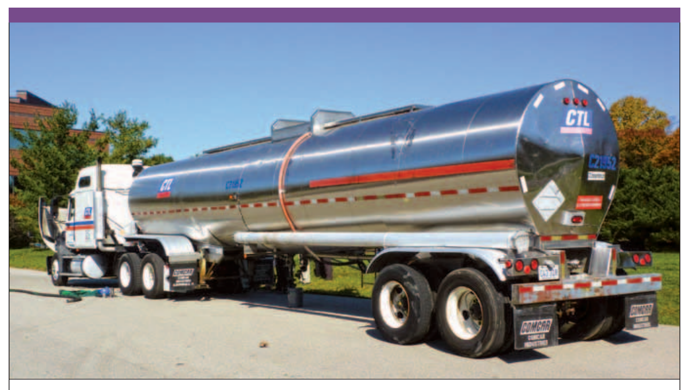
Proper handling of chemical shipments in transit includes pairing the product with the right type of equipment, keeping it at the correct temperature, and cleaning the container thoroughly between shipments.

facilities used to manage chemicals, and reviews all the related documentation. "Complying with multiple agencies is complex, but important," he notes.